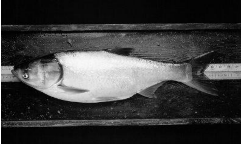
Silver Amur (Silver carp, Hypophthalmichthys molitrix )

Silver amur are distantly related to white amur, both are members of the family Cyprinidae. Silver amur have grown to 12 kg in New Zealand. Unusual among fish, a planktonivorous species, filtering plankton from the water.